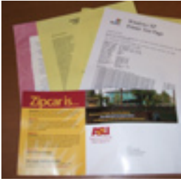
Office Paper No paper clips and rubberbands