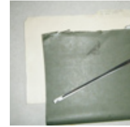
File Folders Metal parts must be removed.