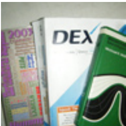
All Books Hard backs, soft backs, and phone books