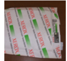
Copier Paper Wrappers