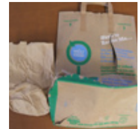
Paper Bags and Wrap Any color