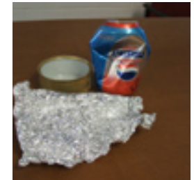
Aluminum Cans, Steel, Tin, and Foil

NO: LIQUIDS, glass, pizza boxes, plastic wrap, plastic bags, Styrofoam™, packaging peanuts, food, drinking straws, paper cups, rubberbands, paper clips or trash of any kind