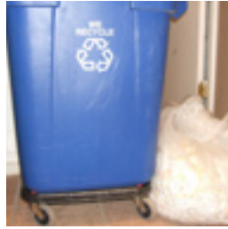
Shredded Paper Put in clear plastic bags