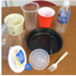
All Hard Plastic Containers, Lids, Caps and Utensils