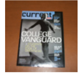
Magazines No plastic wrappers